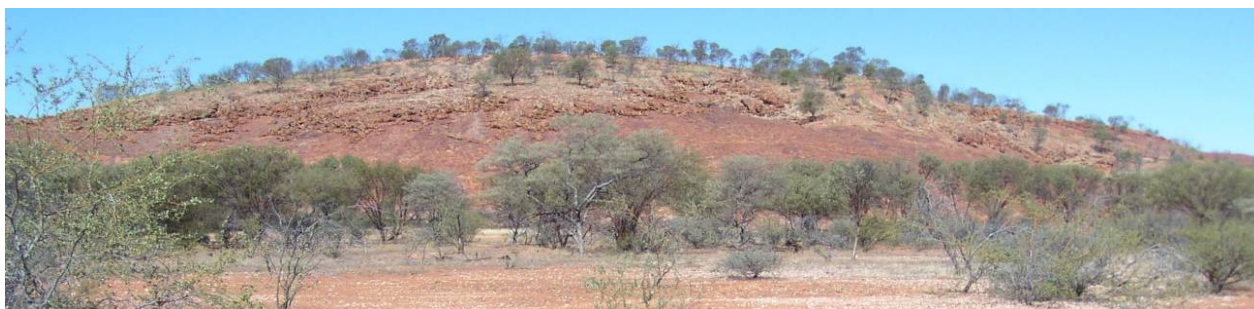
Red Rock, a granite inselberg, contains surface rock chip assays up to 946ppm Uranium

Four samples were collected and submitted to Genalysis Laboratory Services for assay using a 4-acid digest and analysis via ICPMS for uranium and certain other elements.