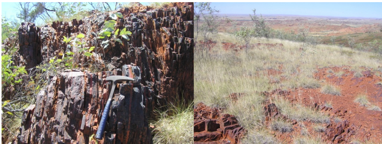
BIF outcrop on top of Corunna Downs ridge

Geology of the Corunna Downs iron capped ridge is tightly folded and steeply dipping. Ferruginous chert and banded iron formation comprises of banded siliceous and haematitic material which in places has been altered to limonitic iron ore.